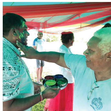
Minister - Hon. Dr. Mahendra Reddy celebrating Holi in Navua.

"The entire message of Holi is about trust, so we must continue to trust in our leadership," said Minister Reddy.