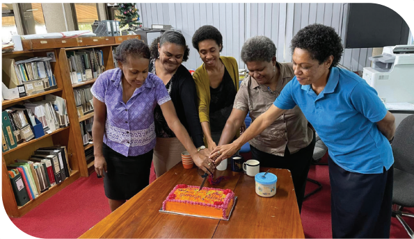
Landuse staff celebrating Women's Day