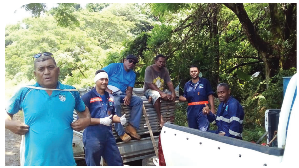
Ministry staff in Koro