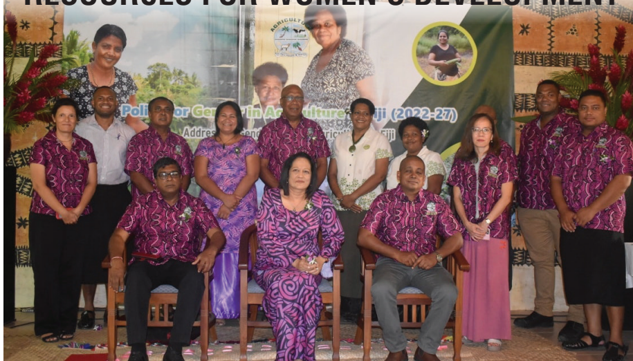
Executive Officials during the Gender Policy Booklet launching at the South Sea Orchard in Nasau, Nadi.

The Ministry of Agriculture will earmark the allocation of more resources towards developing women in agriculture.