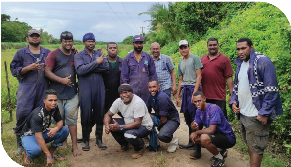
Stray Animal team in the West