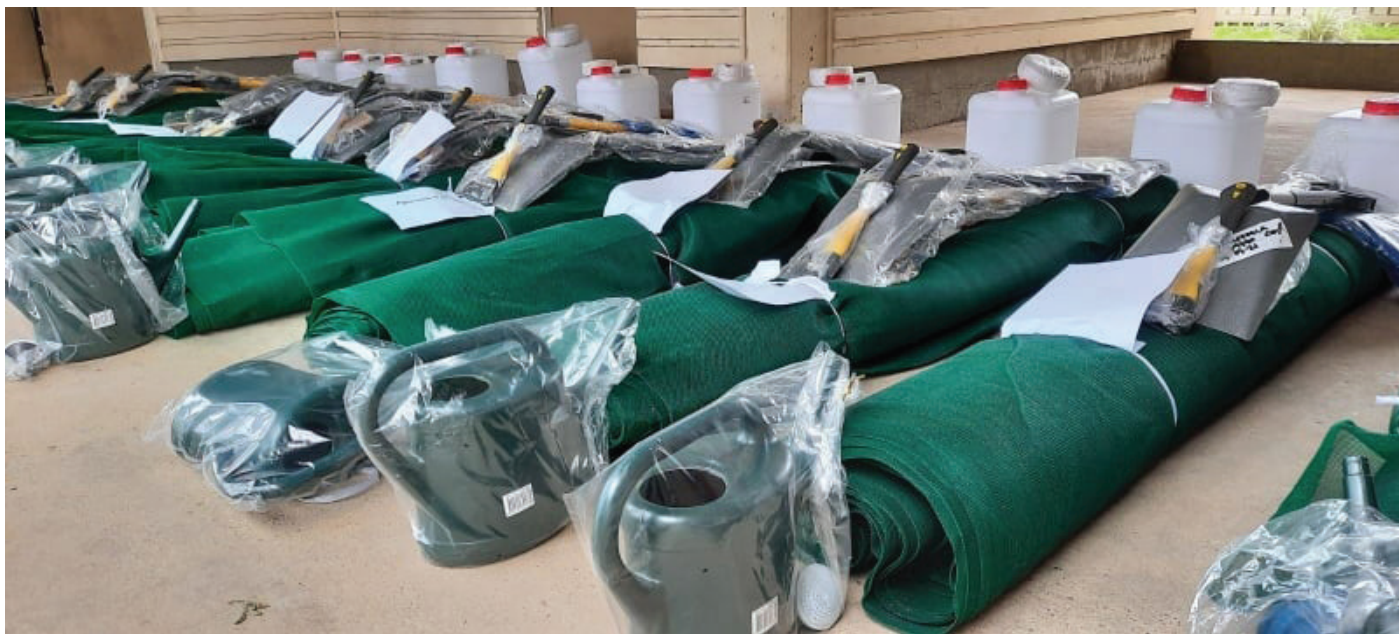
Materials for Nursery Kit support programme

The newly launched Nursery Support Package will help to set the platform to boost the production of crops for the local and export markets, regardless of crop seasonality.