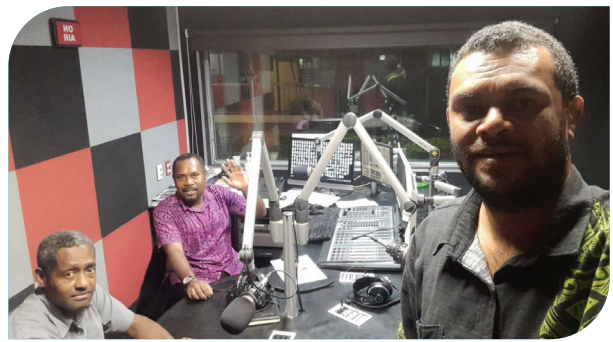
AH&P staff at FBC for talkback show