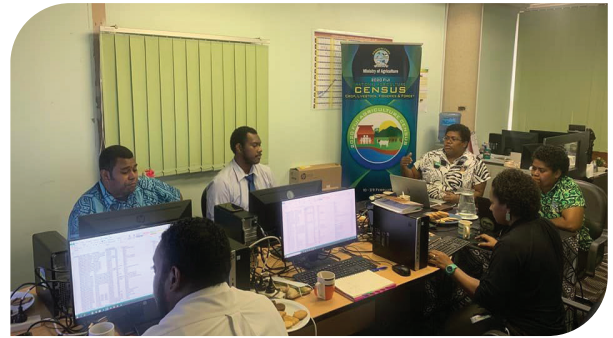
The Economic Planning & Statistics Division facilitated the training on the use of KOBO Toolbox application to the technical officers of the Poverty Monitoring Unit.