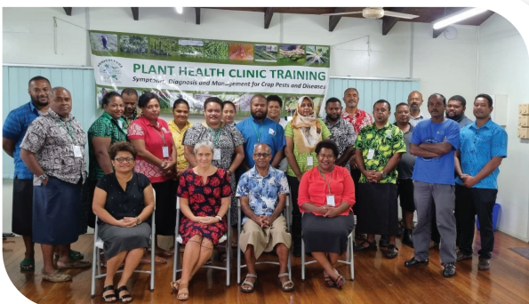
Participants at the Plant Health Clinic Training at SPC Campus, Narere.