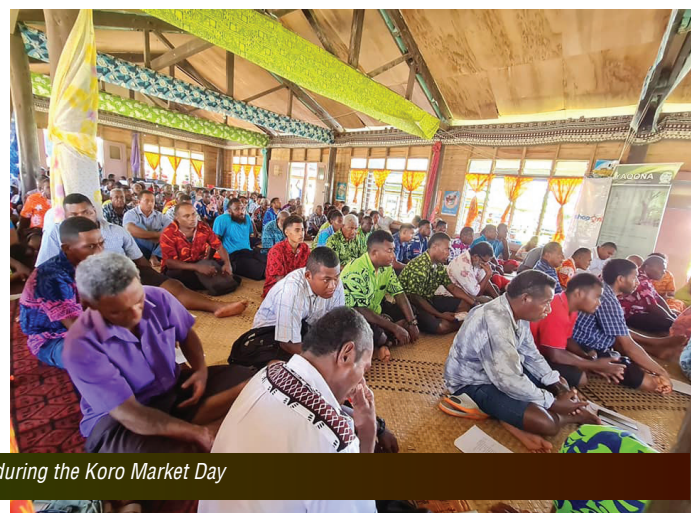
Koro farmers in attendance during the Koro Market Day